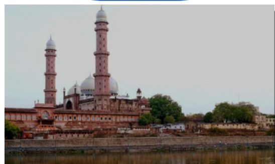
Taj Ul Masjid