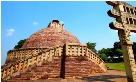
Buddhist Temple, Sanchi